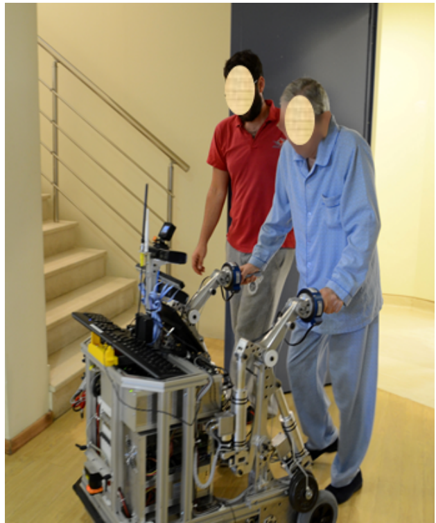
Fig. 3: End-user evaluation of the robotic rollator at the DIAPLASIS rehabilitation center in Kalamata, Greece.

Though all trials have been positively assessed in terms of feasibility and adequacy to the user needs, especially regarding the basic walking assistance, and the subjective user perception of the robotic device and its assistance systems [15], the “human” like characteristics of interaction have been the features which have received the highest scores in respect to user trust and user satisfaction. Such results are revealing regarding user expectations from devices, which are designed to be intensively used in a variety of home and clinical/rehabilitation contexts and demand a long-term user engagement [16]. These findings have driven the design of the human-robot interaction model in our current study. Thus, the communication ecosystem incorporates a set of multimodal interaction options which intent to raise user trust and engagement on the basis of knowledge gained from end user evaluation results of the assistive device, but also