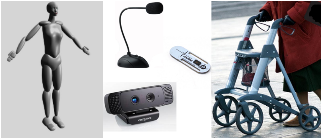
Fig. 1: The assistive robotic platform concept.